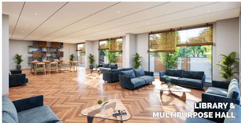
Graphics, equipment and furniture showed in the View are for simple understanding and presentation purposes. It is not part of the project.